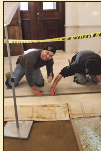
Replacement & installation of tile in vestibule of church.