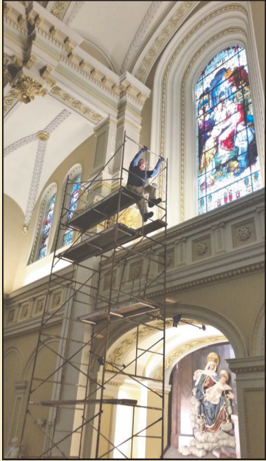
Maintenance work in the church. Scaffolding erected for wall repair.