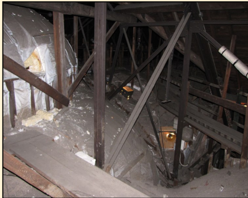
~St. Patrick Church Attic~