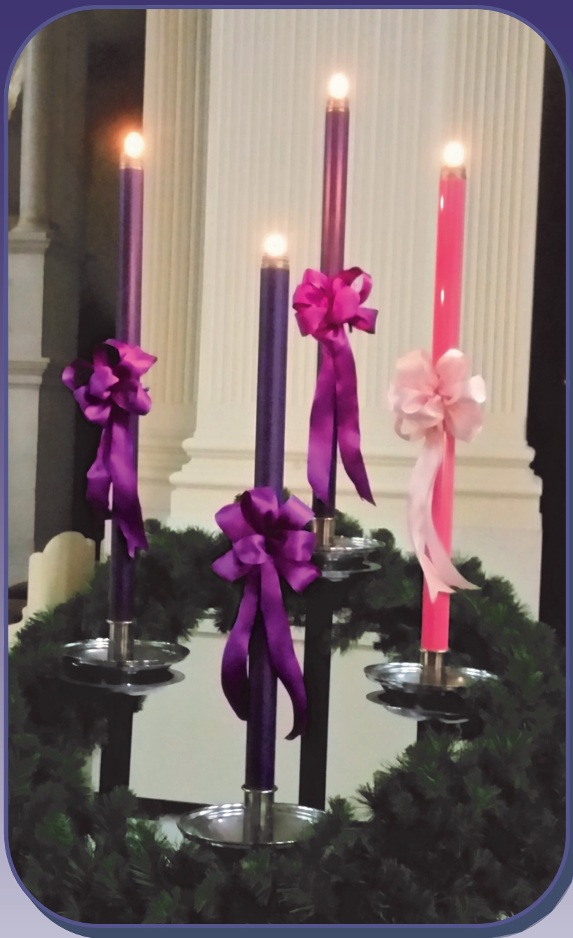
The Advent Wreath St. Patrick Church