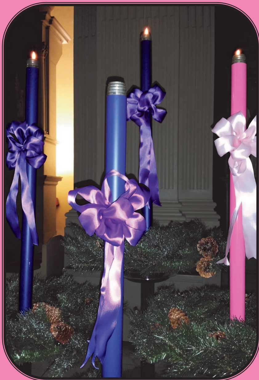
The Advent Wreath St. Patrick Church

Serving the East Bayfront of Erie since 1837