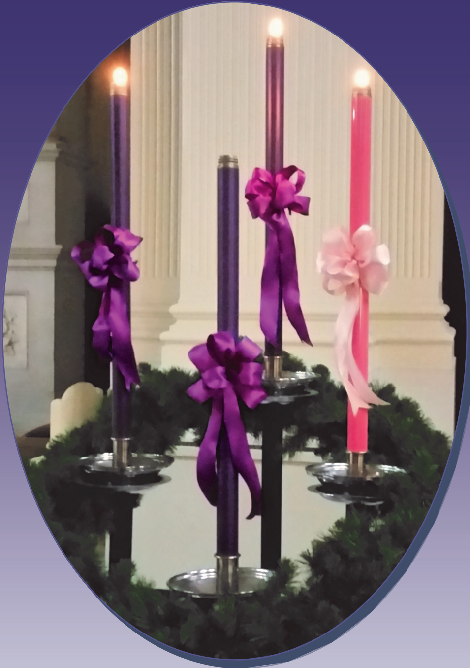
The Advent Wreath St. Patrick Church