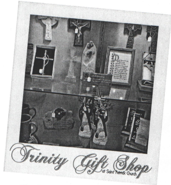
Trinity Gift Shop at Saint Patrick's Church

We're open before & after 5:00 PM & 10:30 AM weekend masses!