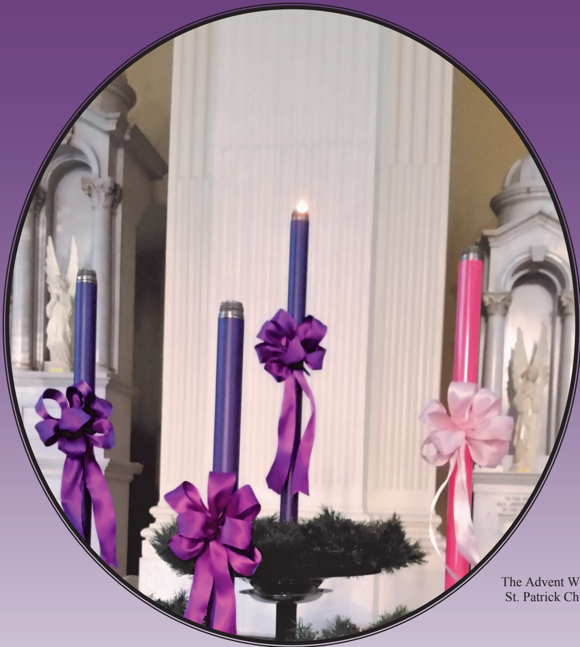
The Advent Wreath St. Patrick Church

Serving the East Bayfront of Erie since 1837