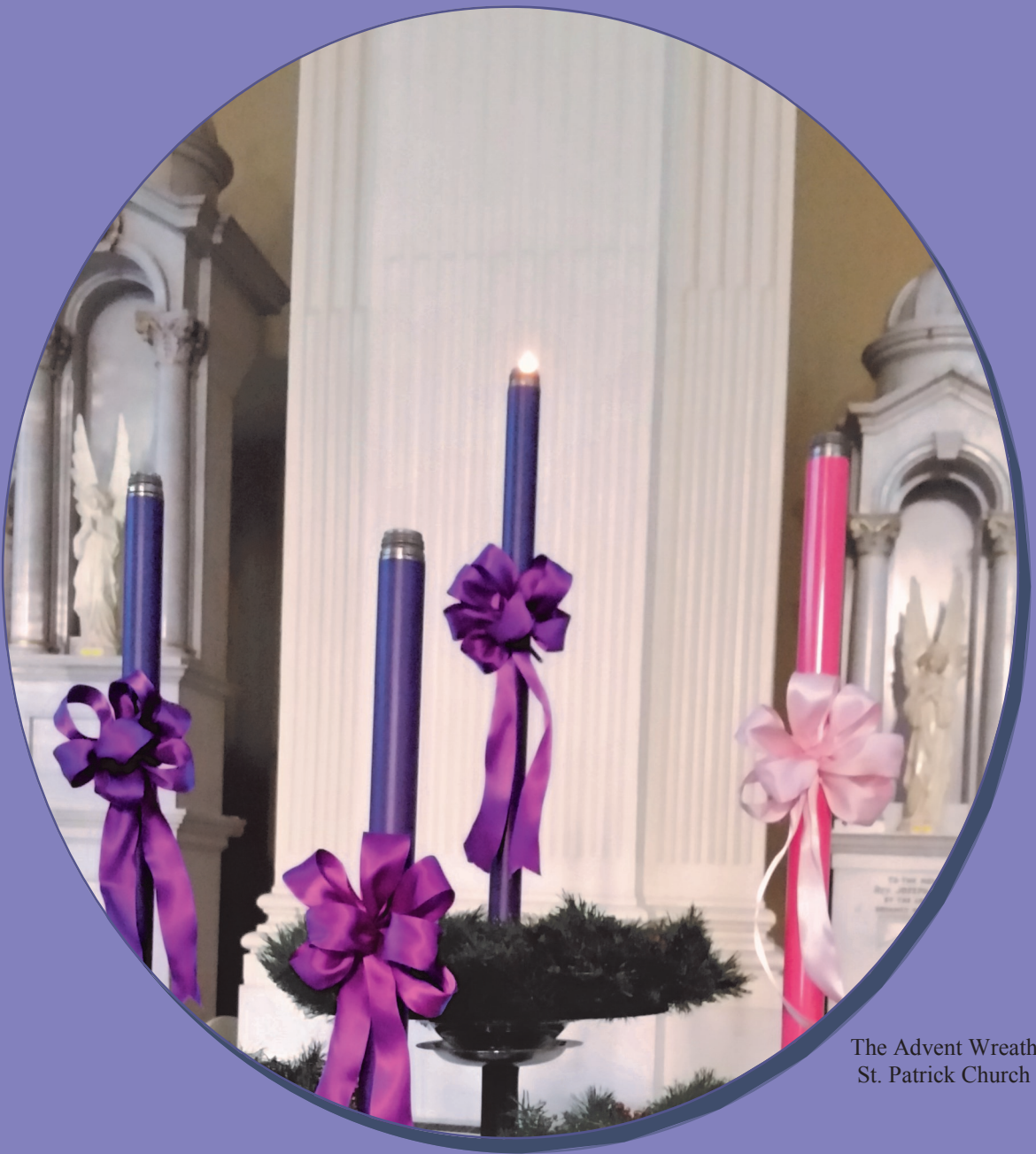
The Advent Wreath St. Patrick Church