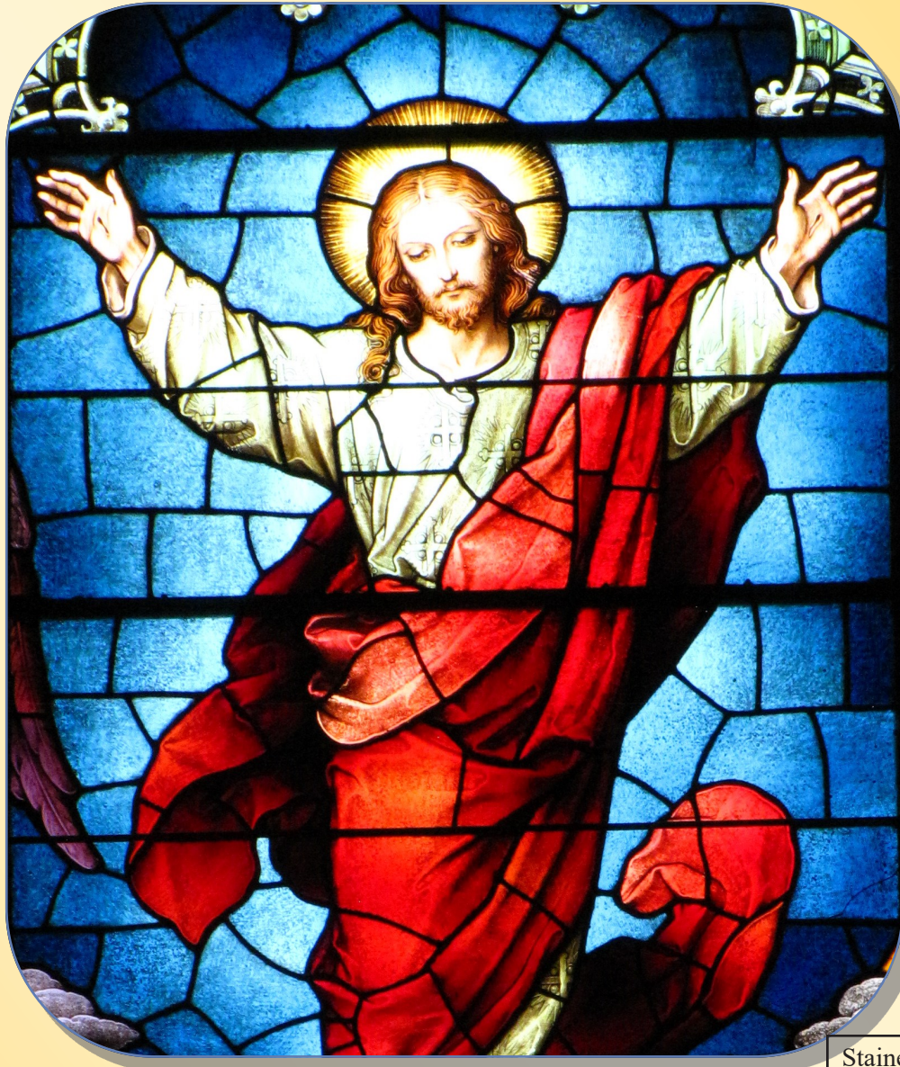
Stained Glass Window St. Patrick Church

Serving the East Bayfront of Erie since 1837