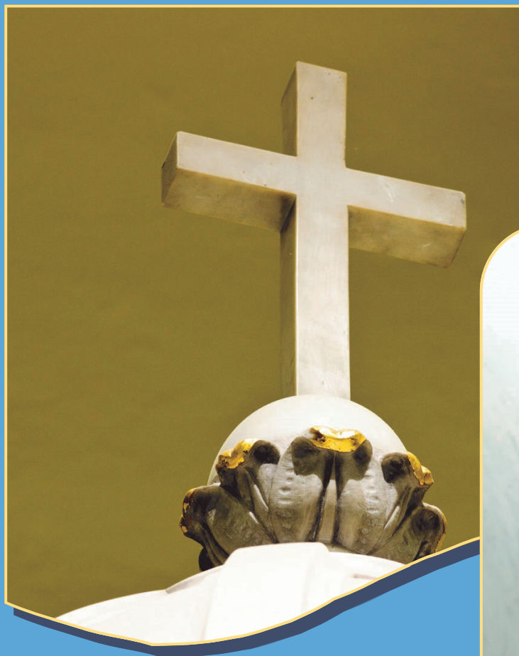
Crosses St. Patrick Church