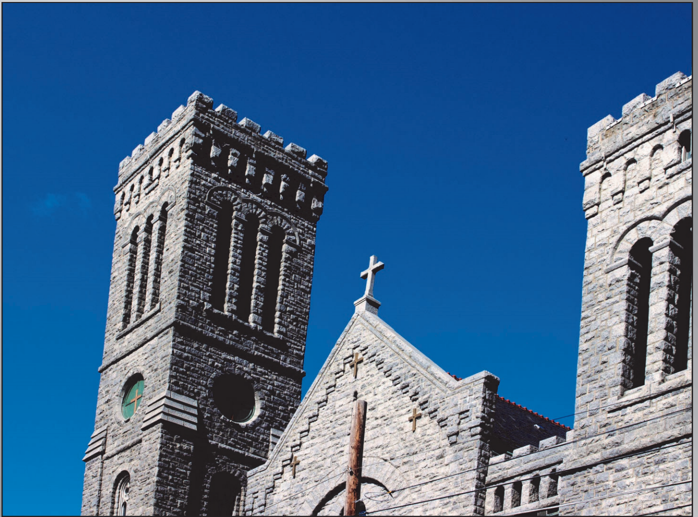
St. Patrick Church

Serving the East Bayfront of Erie since 1837