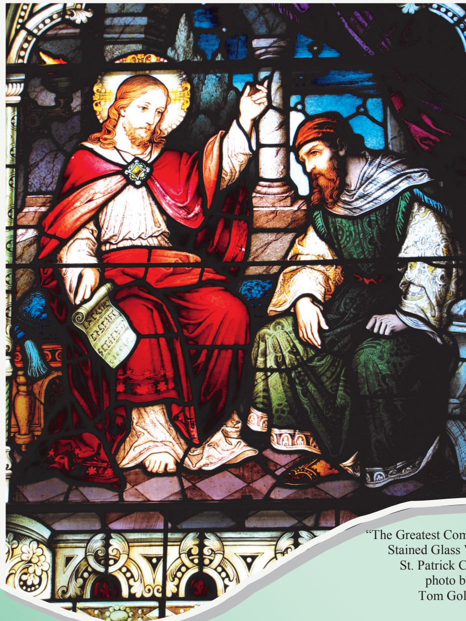
"The Greatest Commandment" Stained Glass Window St. Patrick Church

Serving the East Bayfront of Erie since 1837