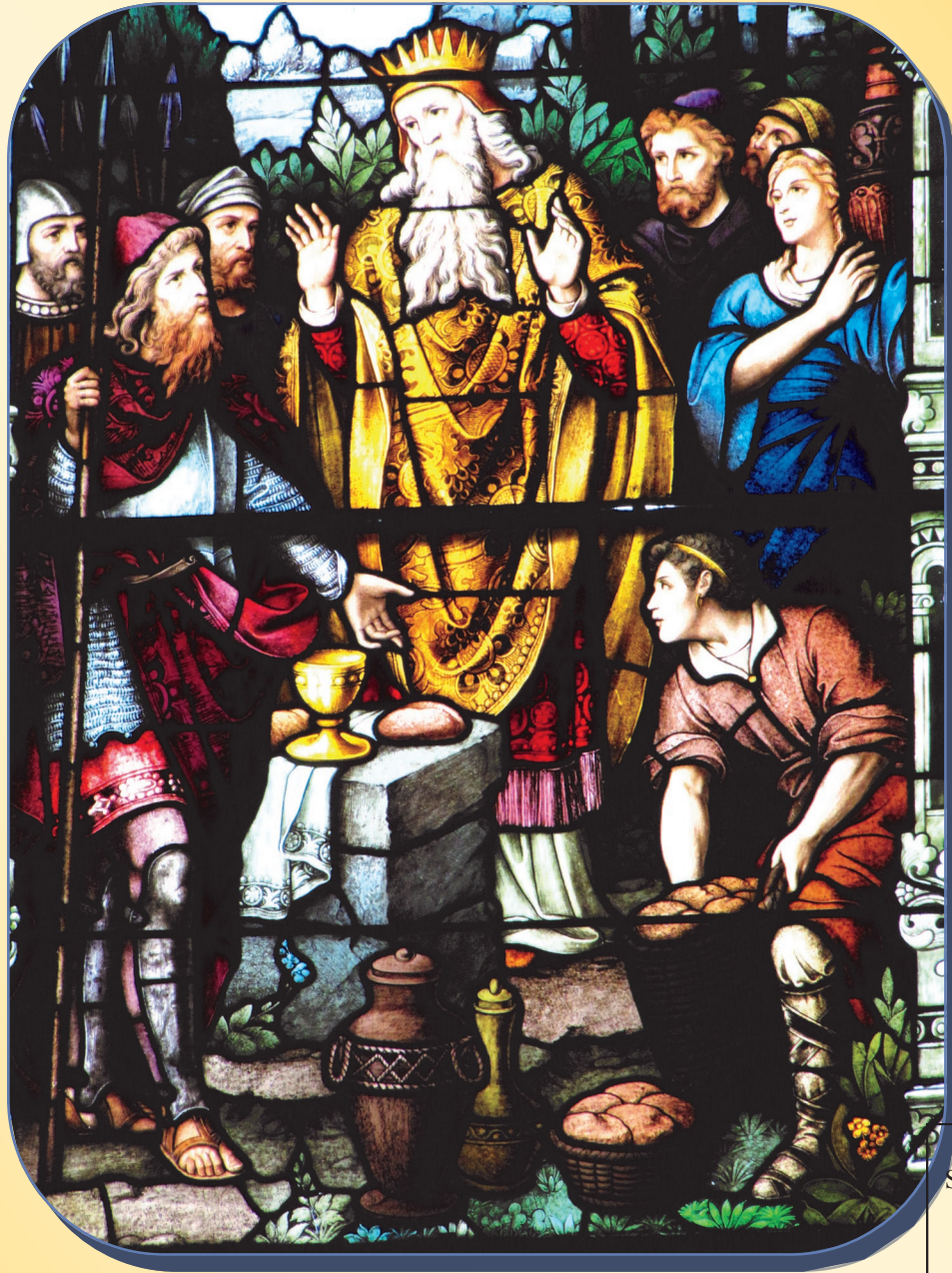
Melchizedek Stained Glass Window St. Patrick Church

Serving the East Bayfront of Erie since 1837