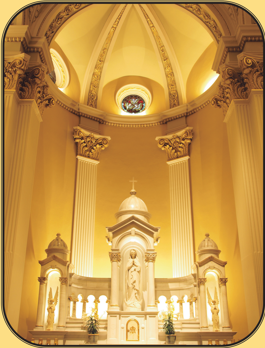
Mary's Altar St. Patrick Church

Thirty-Second Sunday in Ordinary Time November 12, 2017