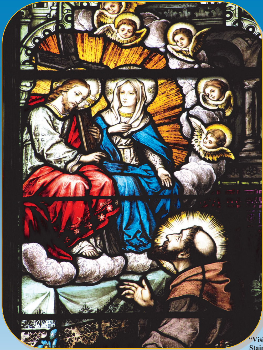
"Visions of St. Francis" Stained Glass Window St. Patrick Church

Serving the East Bayfront of Erie since 1837