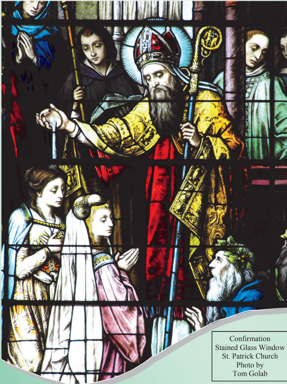
Confirmation Stained Glass Window St. Patrick Church