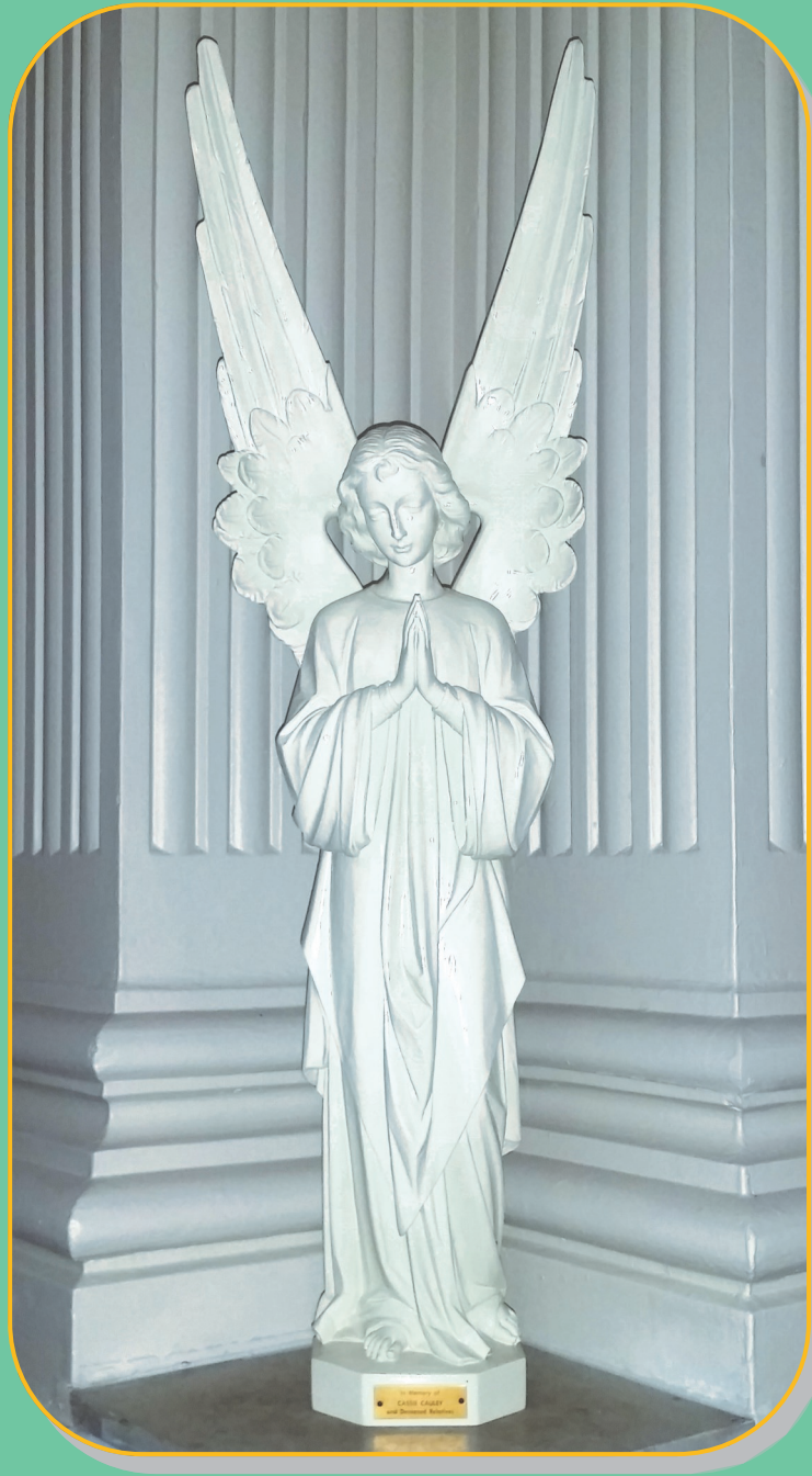
Altar Angel St. Patrick Church

Serving the East Bayfront of Erie since 1837