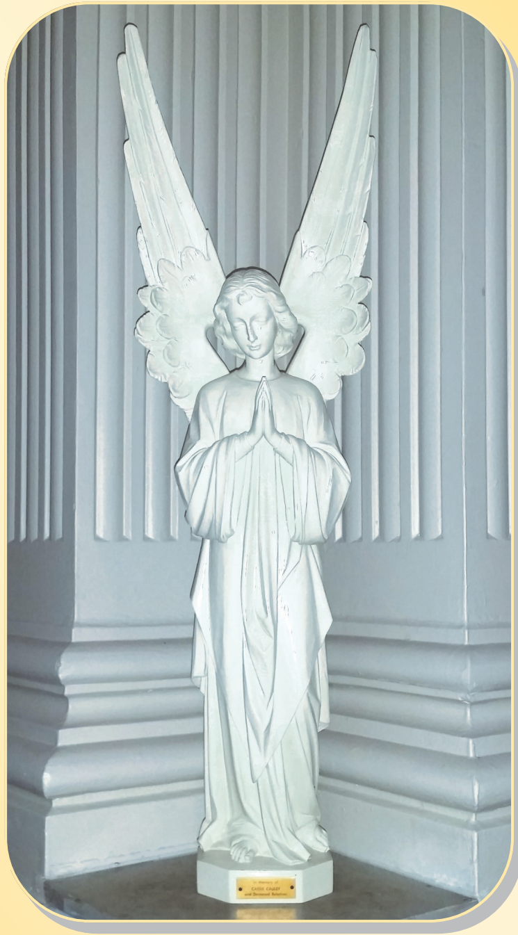
Altar Angel St. Patrick Church

Serving the East Bayfront of Erie since 1837