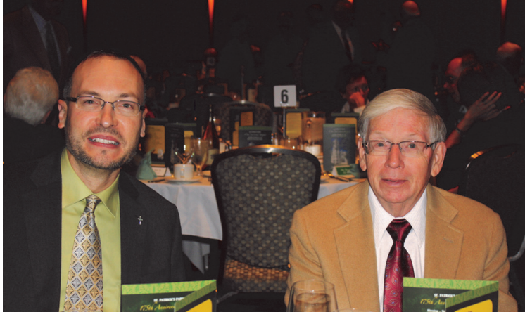
See more photos at our gallery online!