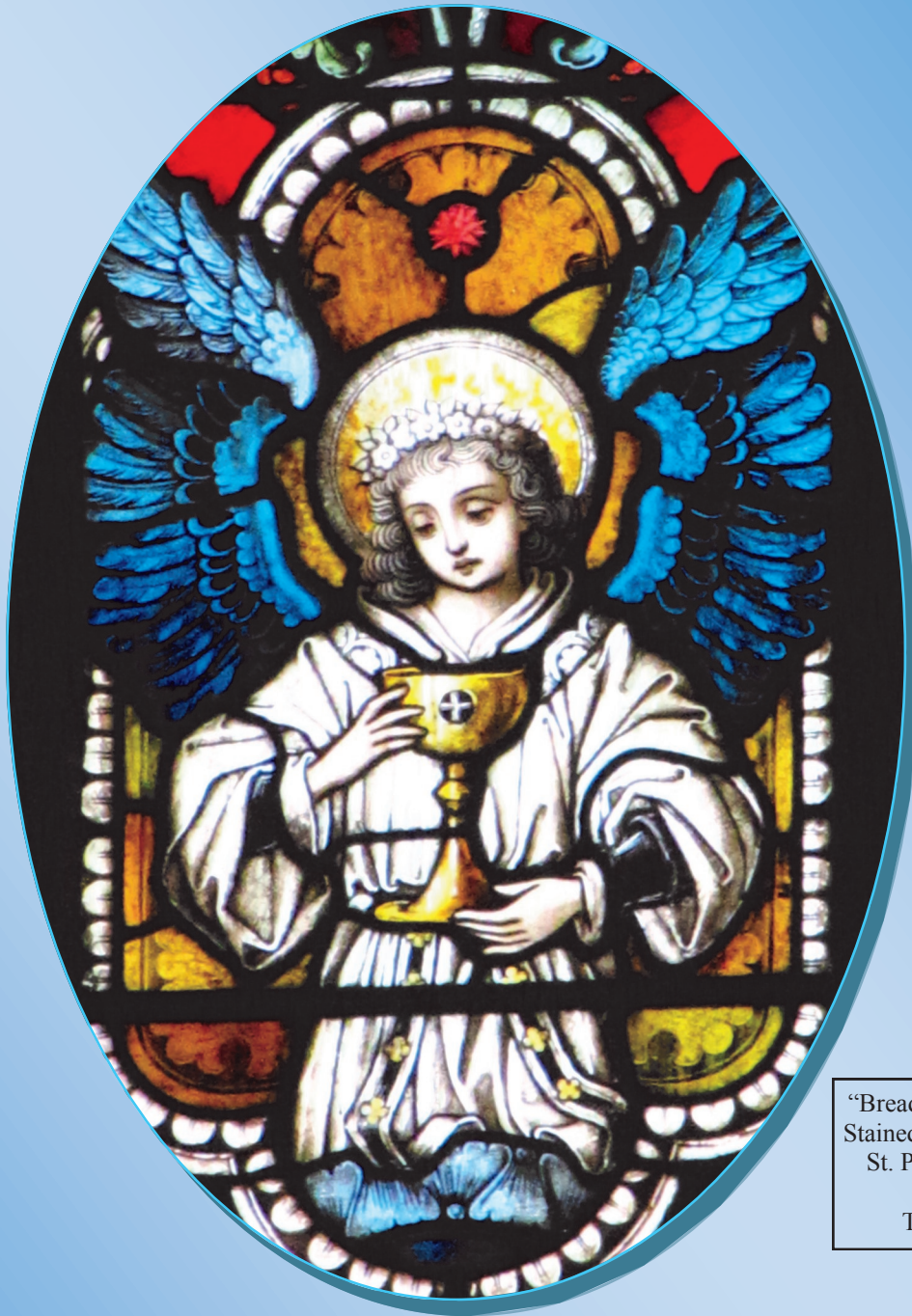
“Bread from Heaven” Stained Glass Window St. Patrick Church

Serving the East Bayfront of Erie since 1837