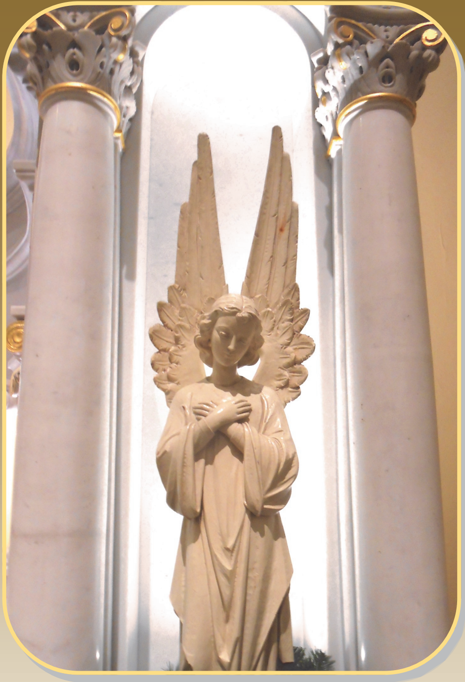
Angel St. Patrick Church