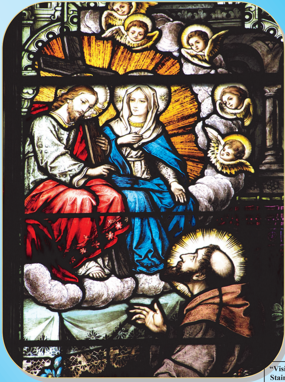
"Visions of St. Francis" Stained Glass Window St. Patrick Church

Thirtieth Sunday in Ordinary Time October 27, 2019