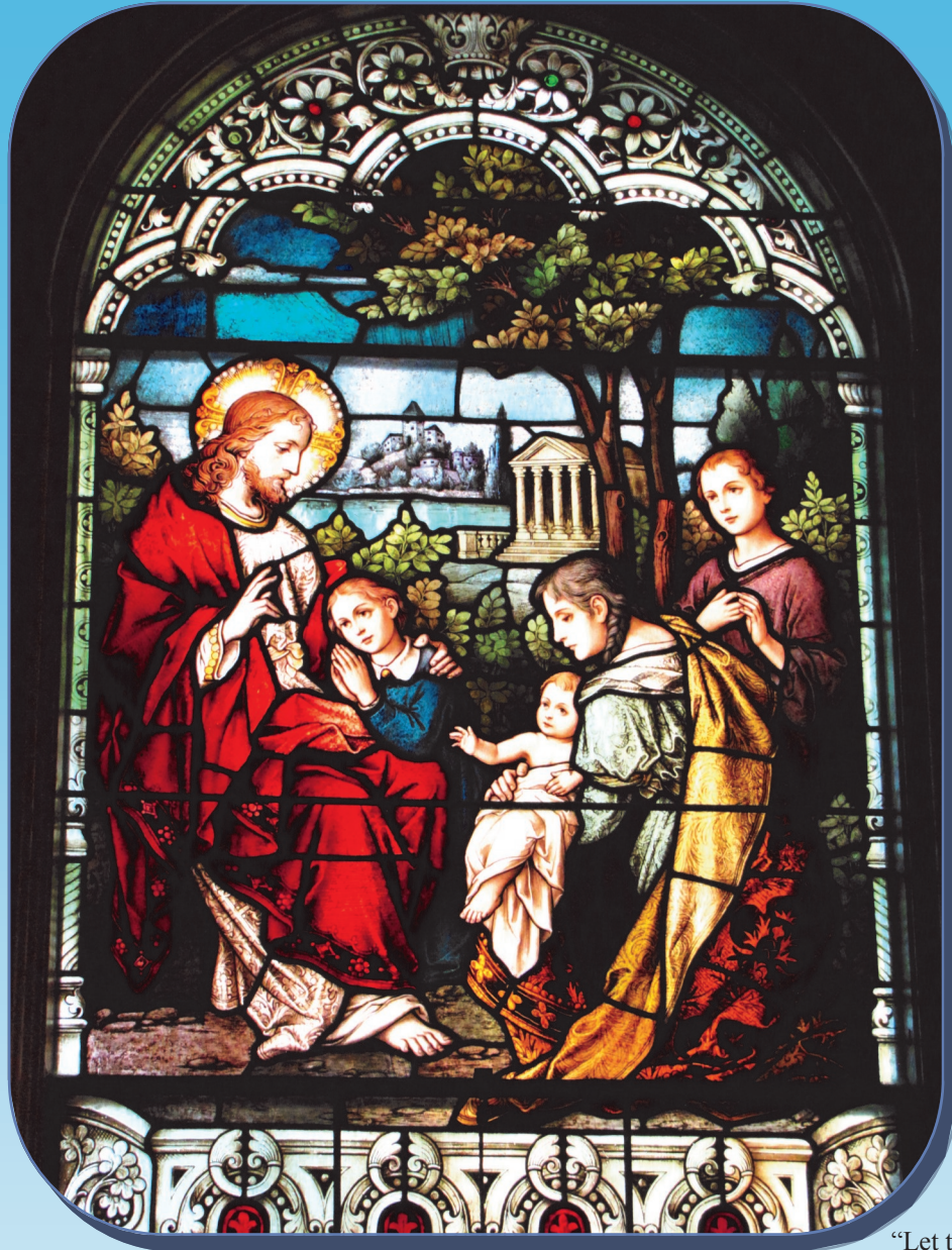
"Let the Children Come" Stained Glass Window St. Patrick Church