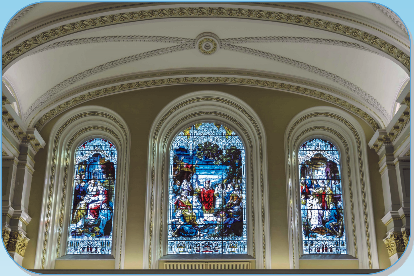
St. Patrick Church