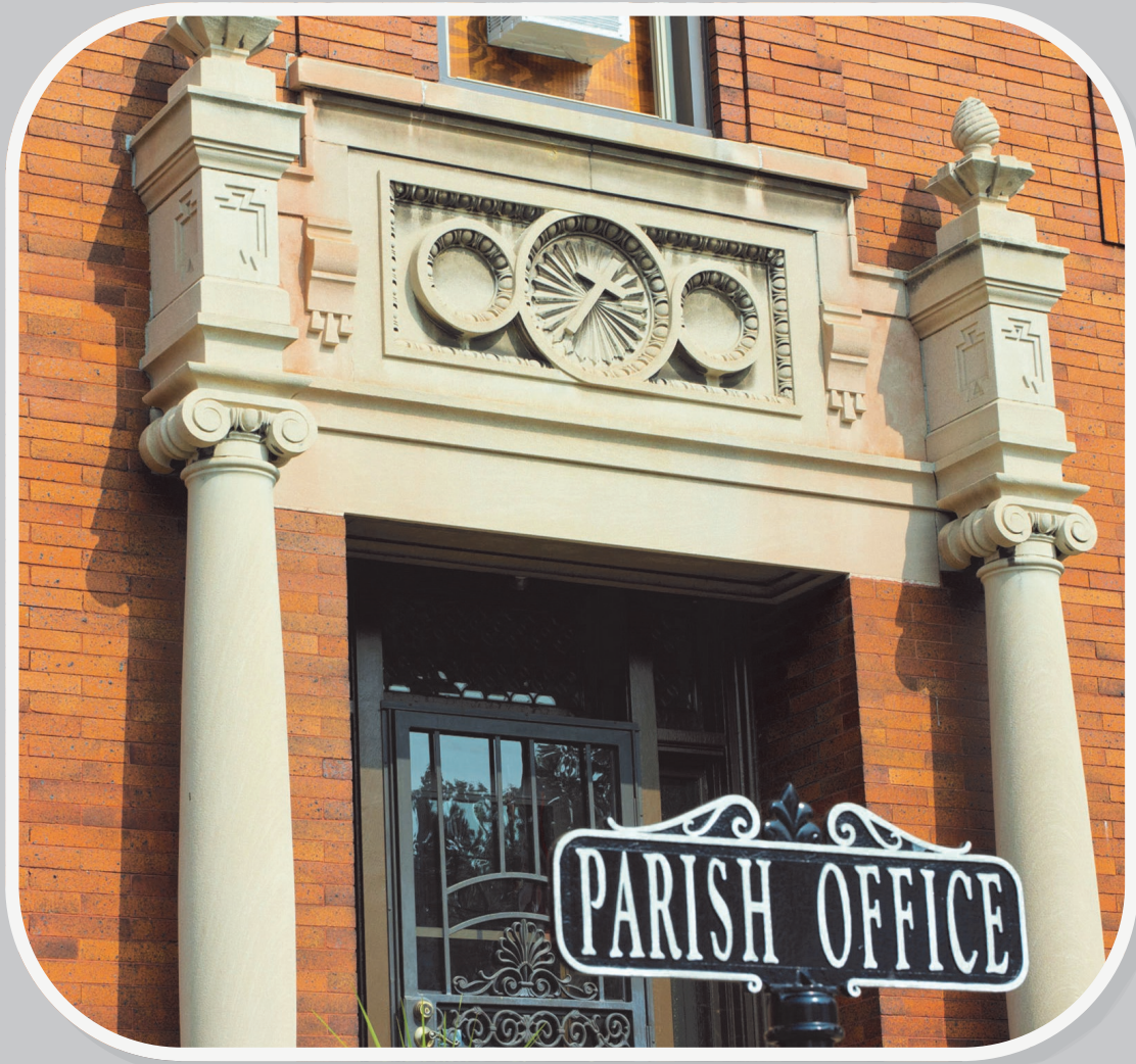
St. Patrick Church, Rectory Parish Office