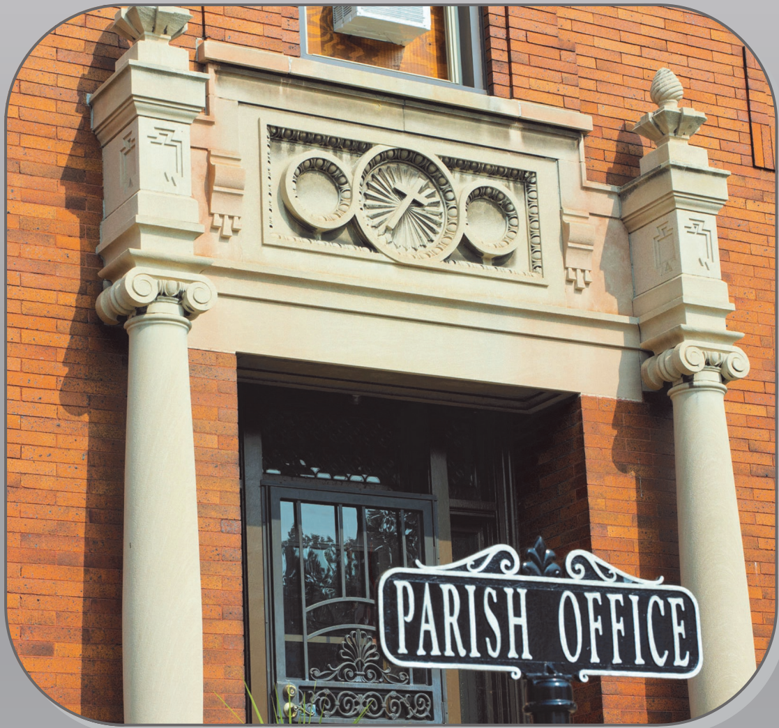
St. Patrick Church, Rectory Parish Office

Serving the East Bayfront of Erie since 1837