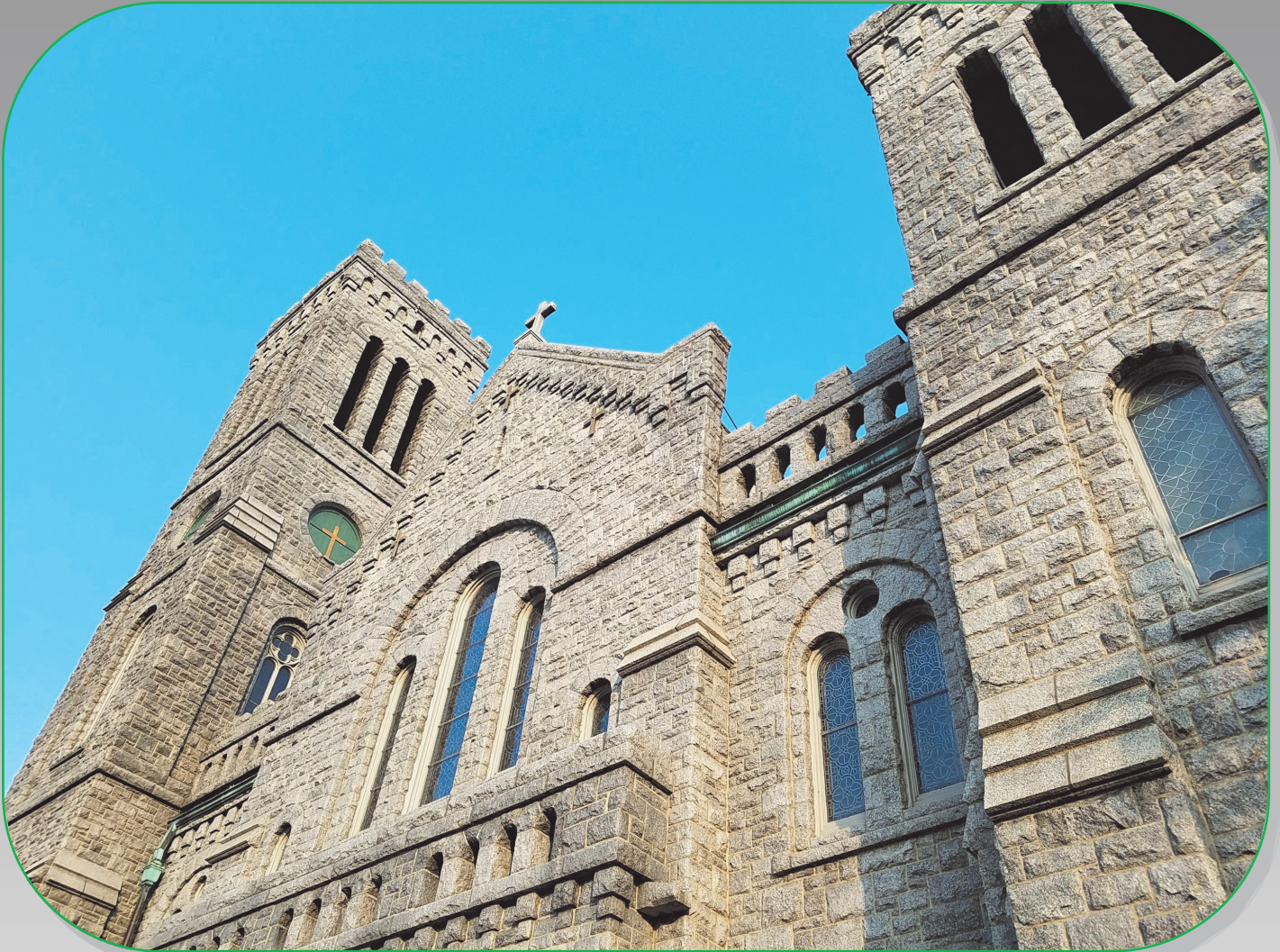
St. Patrick Church

Serving the East Bayfront of Erie since 1837