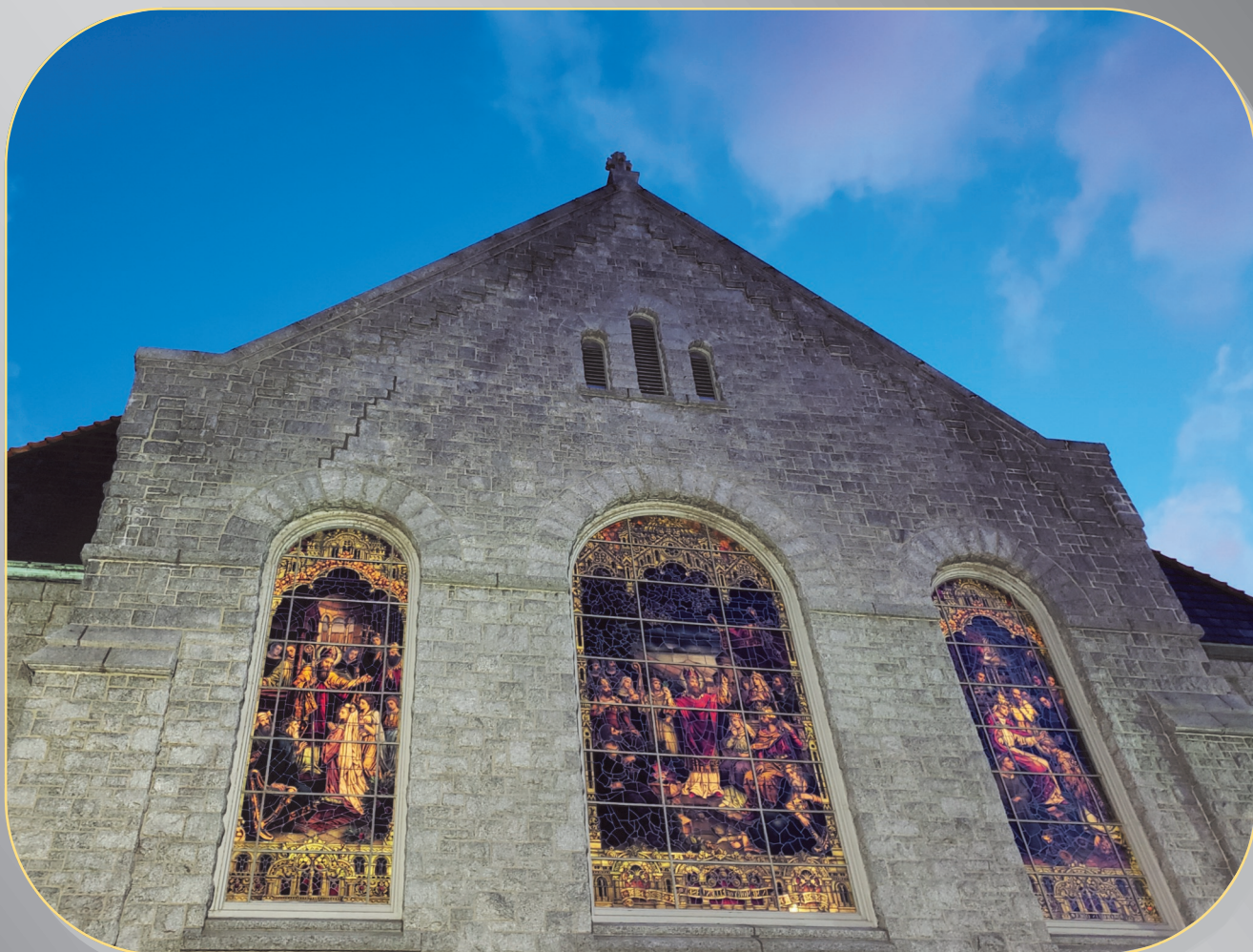
St. Patrick Church (east side wall)