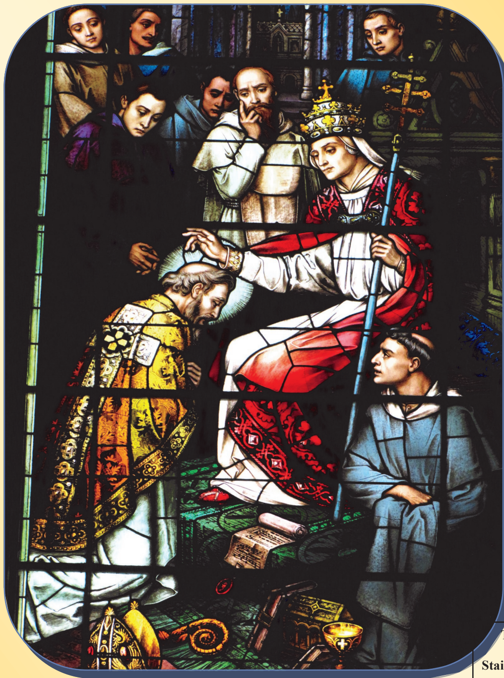
The Coronation of St. Patrick Stained Glass Window

Twenty-Third Sunday in Ordinary Time September 8, 2019