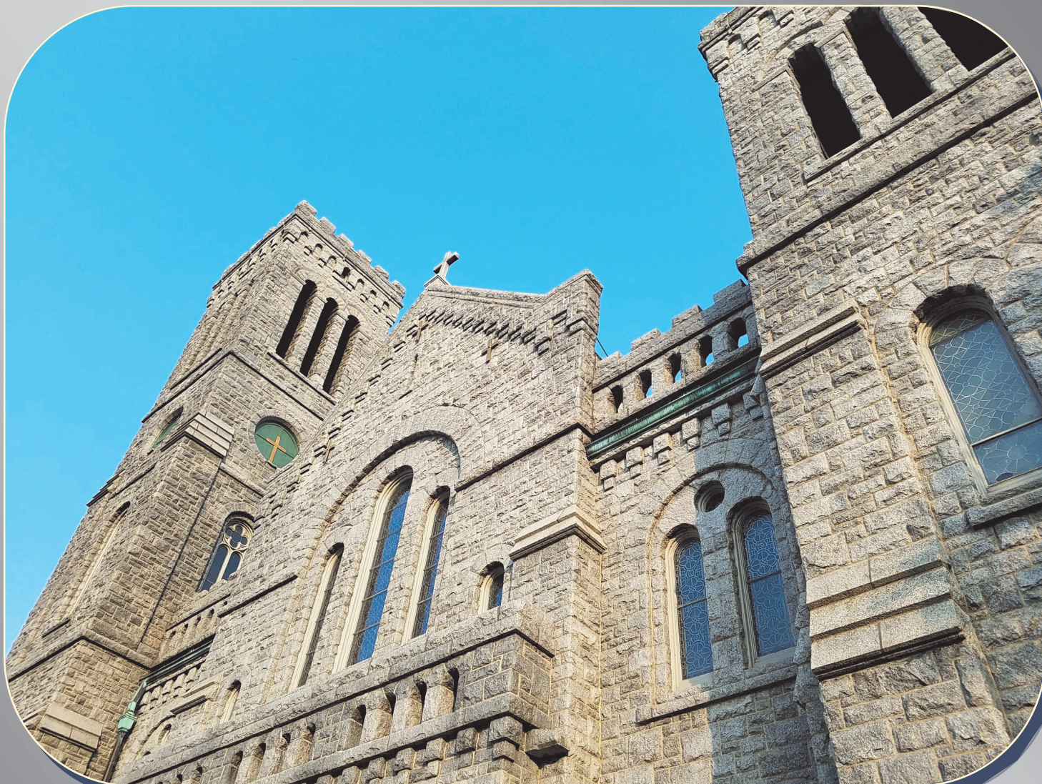
St. Patrick Church

Serving the East Bayfront of Erie since 1837