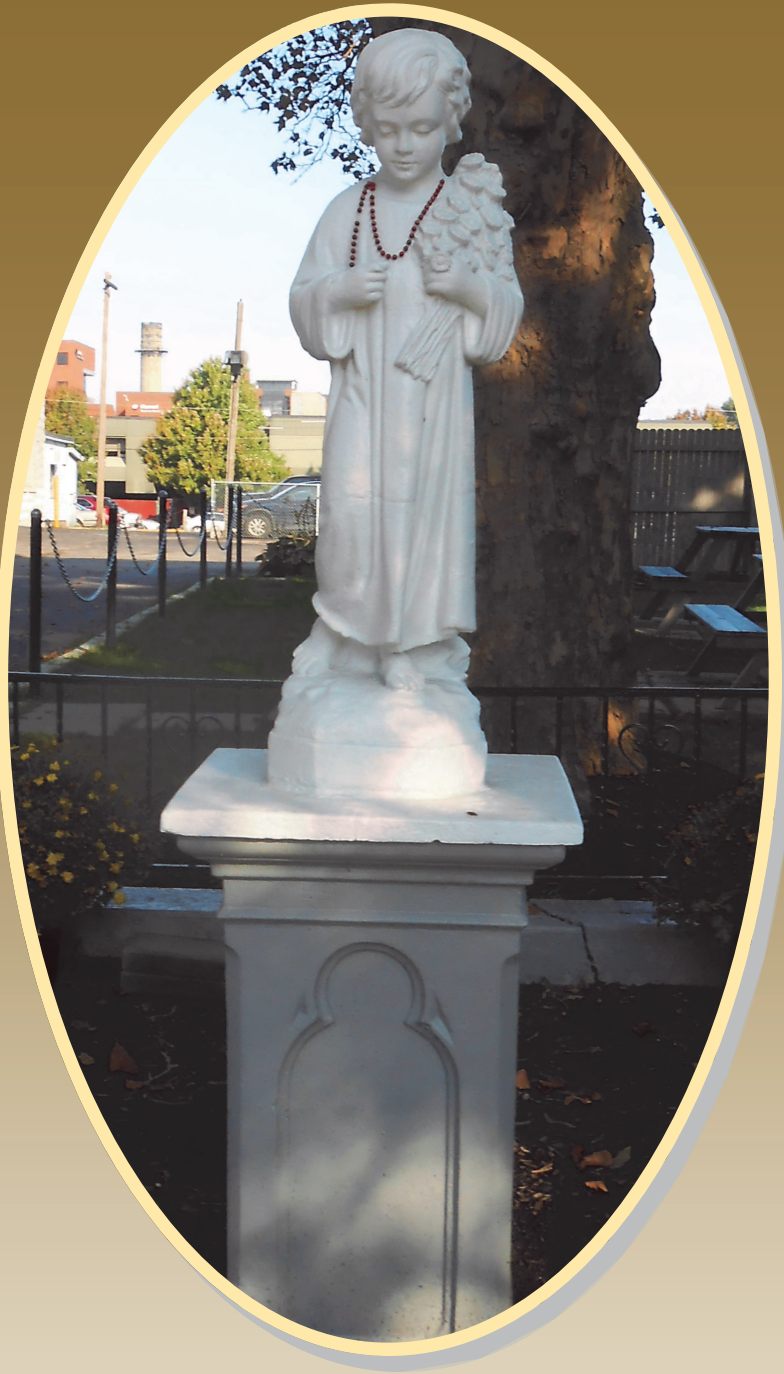
Statue in East Garden St. Patrick Church