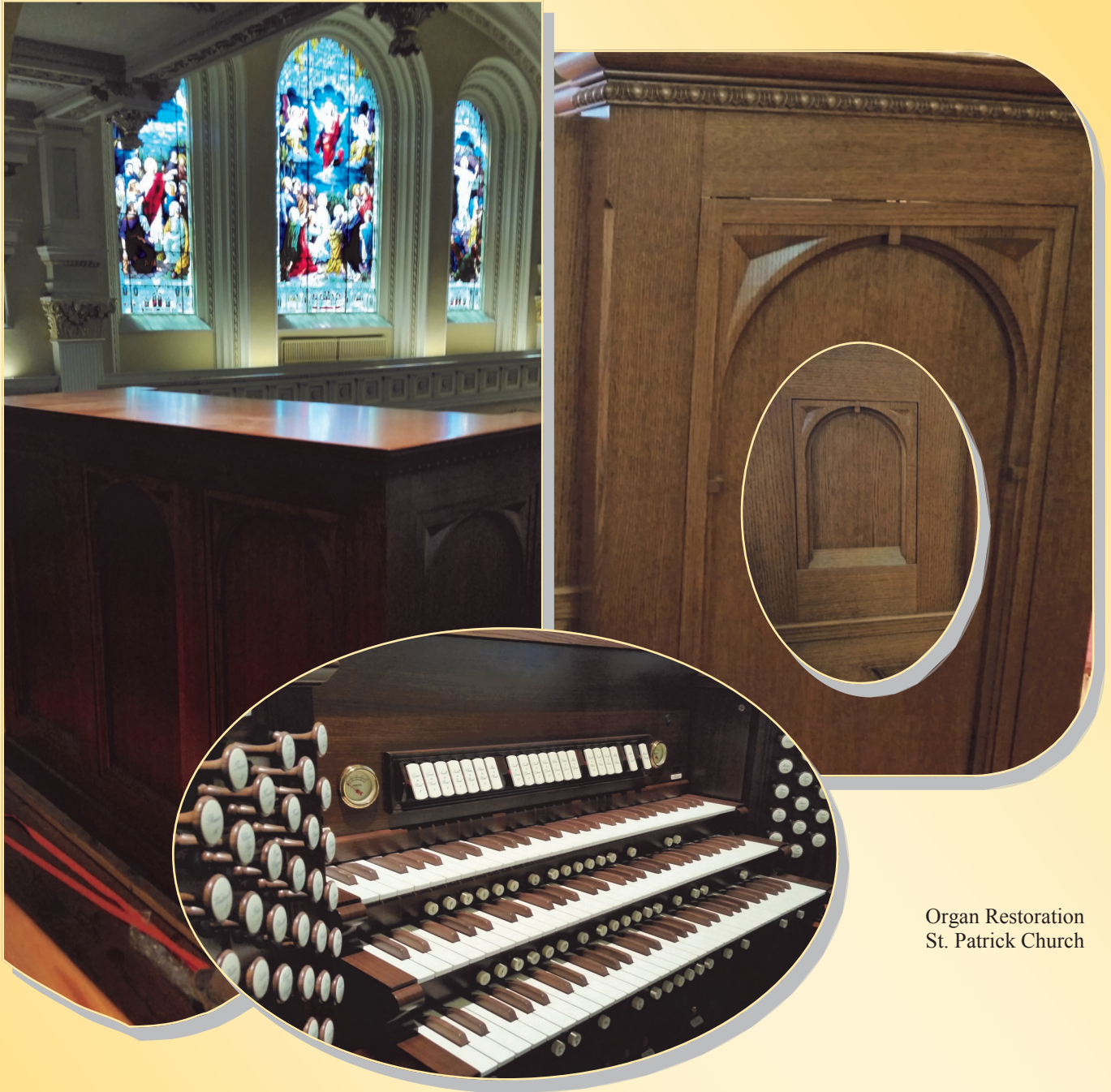
Organ Restoration St. Patrick Church

Serving the East Bayfront of Erie since 1837