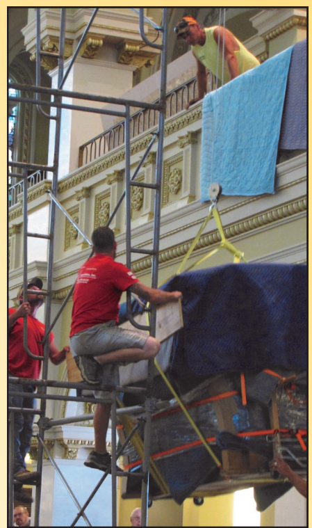
~Lifting the organ console up to the organ loft~