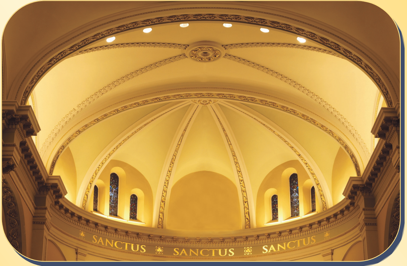
The Sanctuary Dome St. Patrick Church