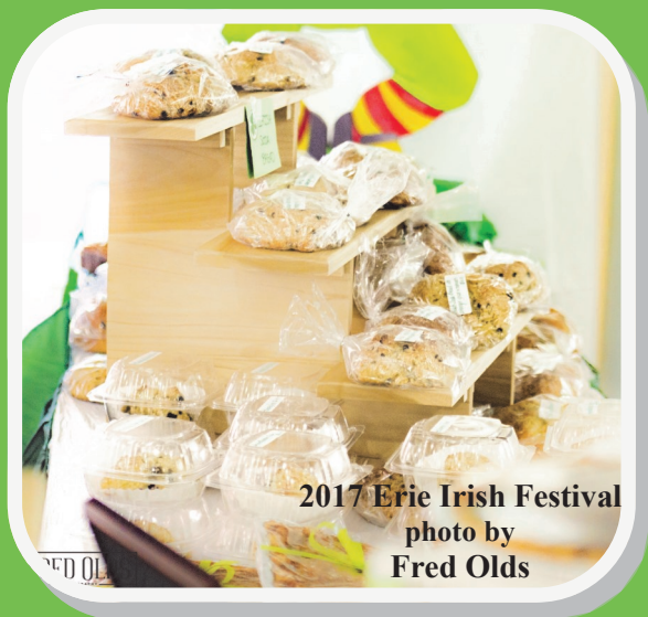
2017 Erie Irish Festival