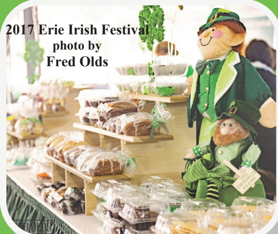
2017 Erie Irish Festival

Feel free to bring your baked goods in at anytime