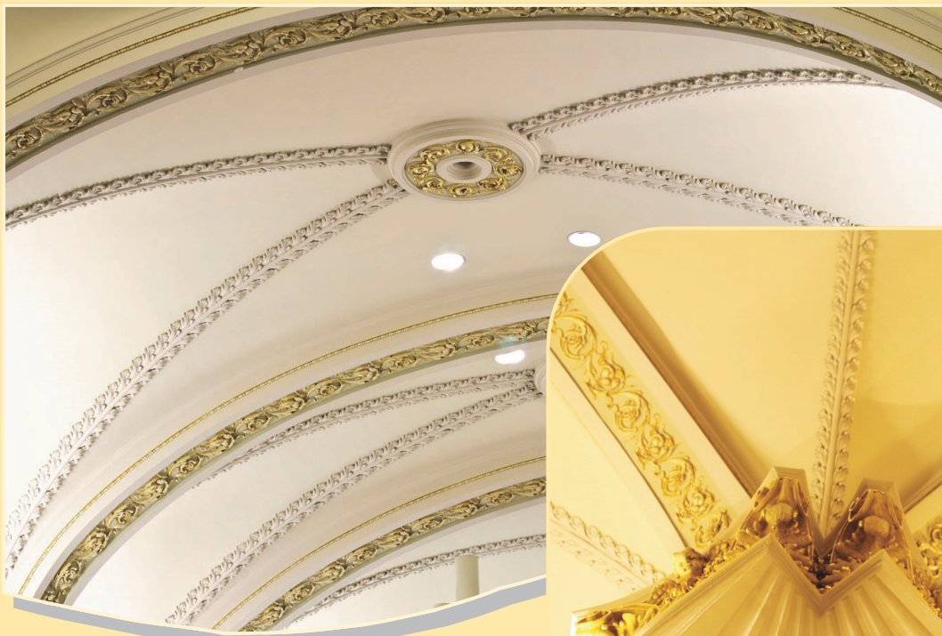
St. Patrick Church