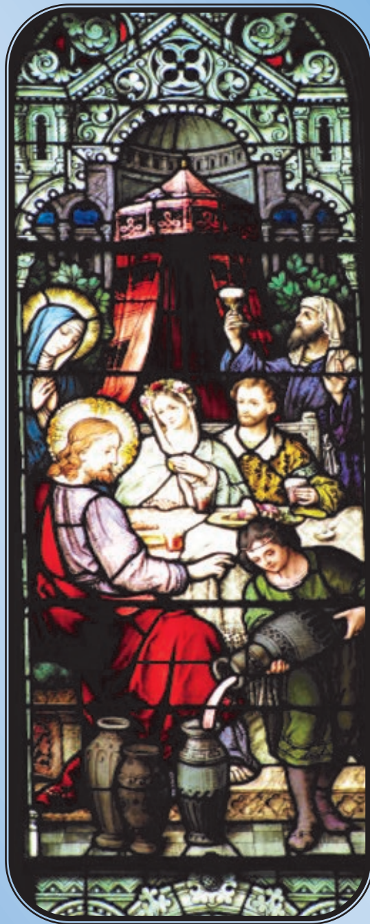
Wedding at Cana Stained Glass Window St. Patrick Church

Serving the East Bayfront of Erie since 1837