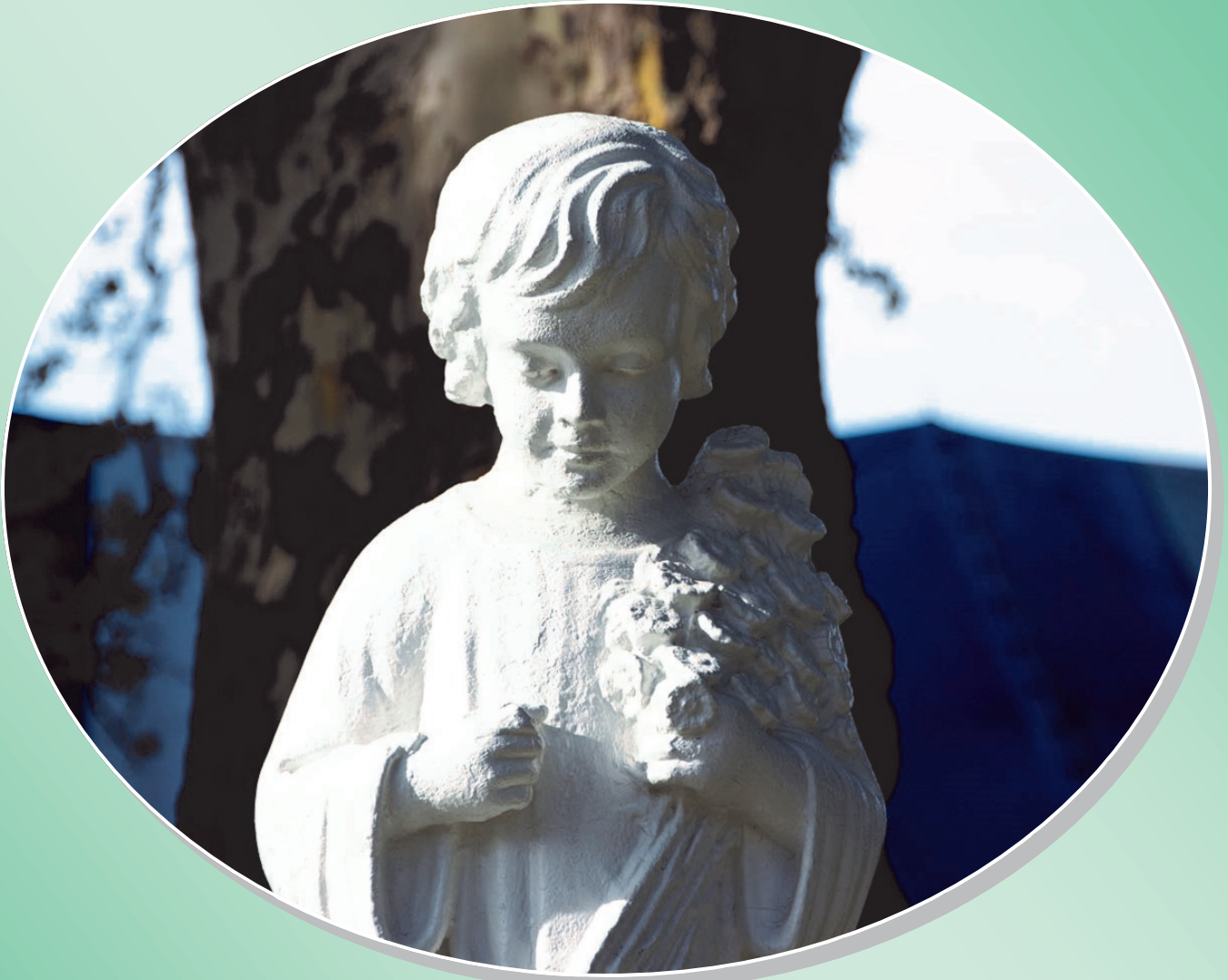
Statue in East Garden St. Patrick Church

Serving the East Bayfront of Erie since 1837