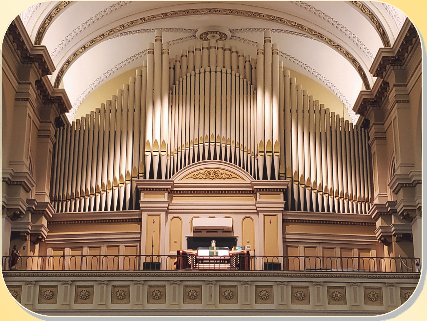
The Organ at St. Patrick Church

Serving the East Bayfront of Erie since 1837