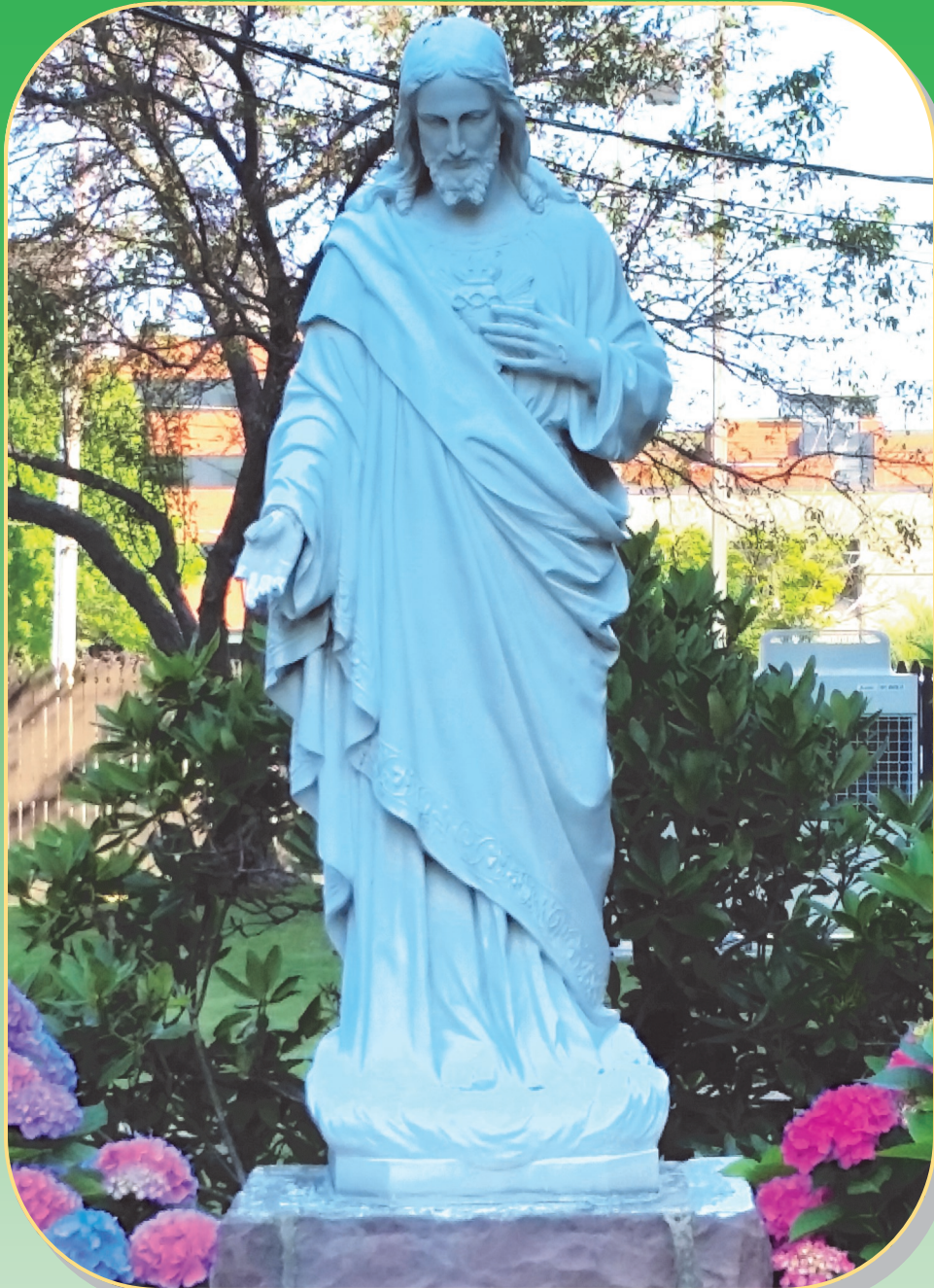
Shrine of the Sacred Heart St. Patrick Church Garden

Serving the East Bayfront of Erie since 1837