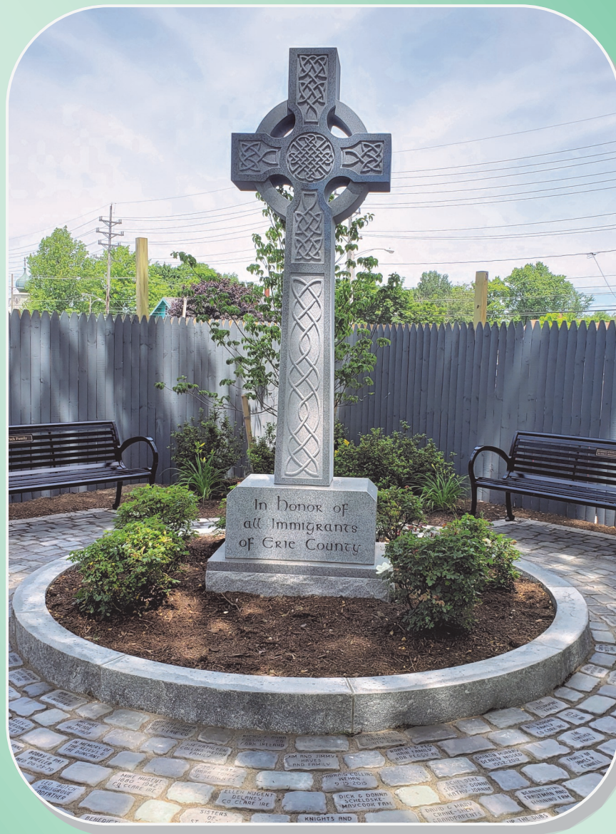
Celtic Monument on the grounds of St. Patrick Church