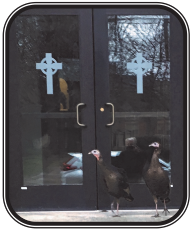
Everyone is trying to get into St. Pat's!!!