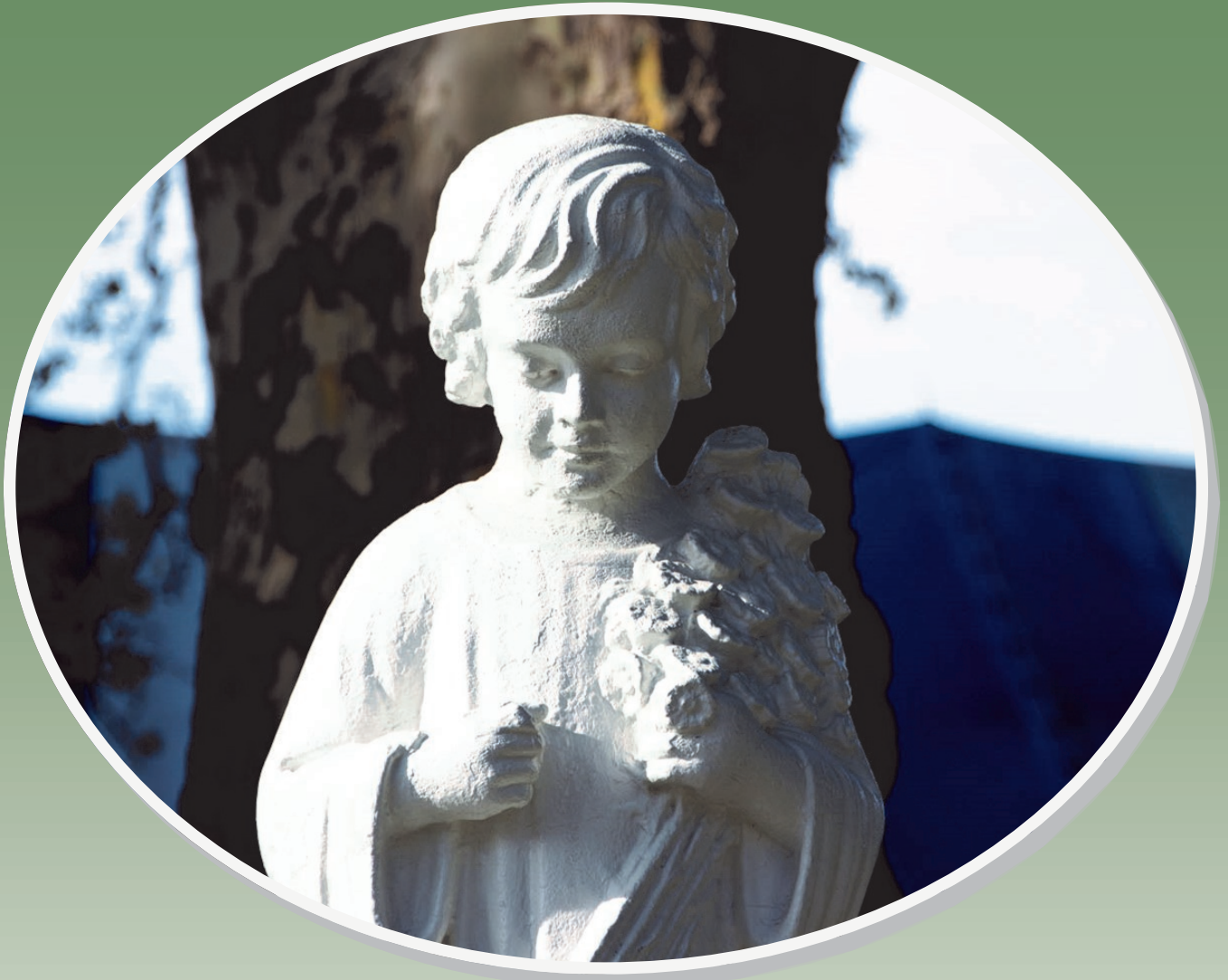
Statue in East Garden St. Patrick Church

Fourteenth Sunday in Ordinary Time July 9, 2017