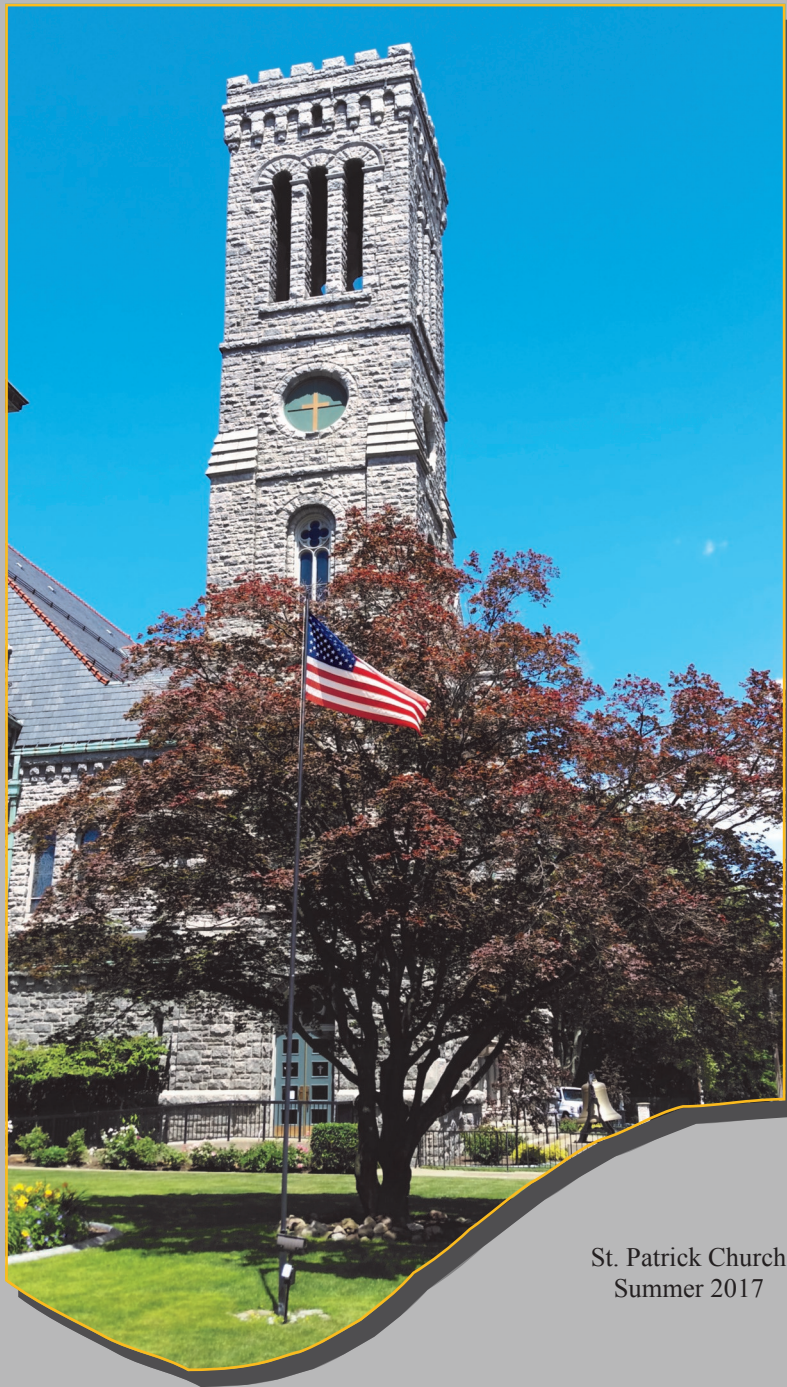
St. Patrick Church Summer 2017

Serving the East Bayfront of Erie since 1837