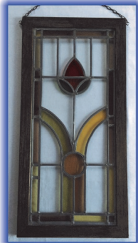
Tulip: 18.5" W x 37" H