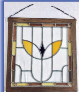
Abstract Floral 29" W x 30" H

Winners will be drawn at "Anchored by Faith and Family" Gala on June 30, 2018