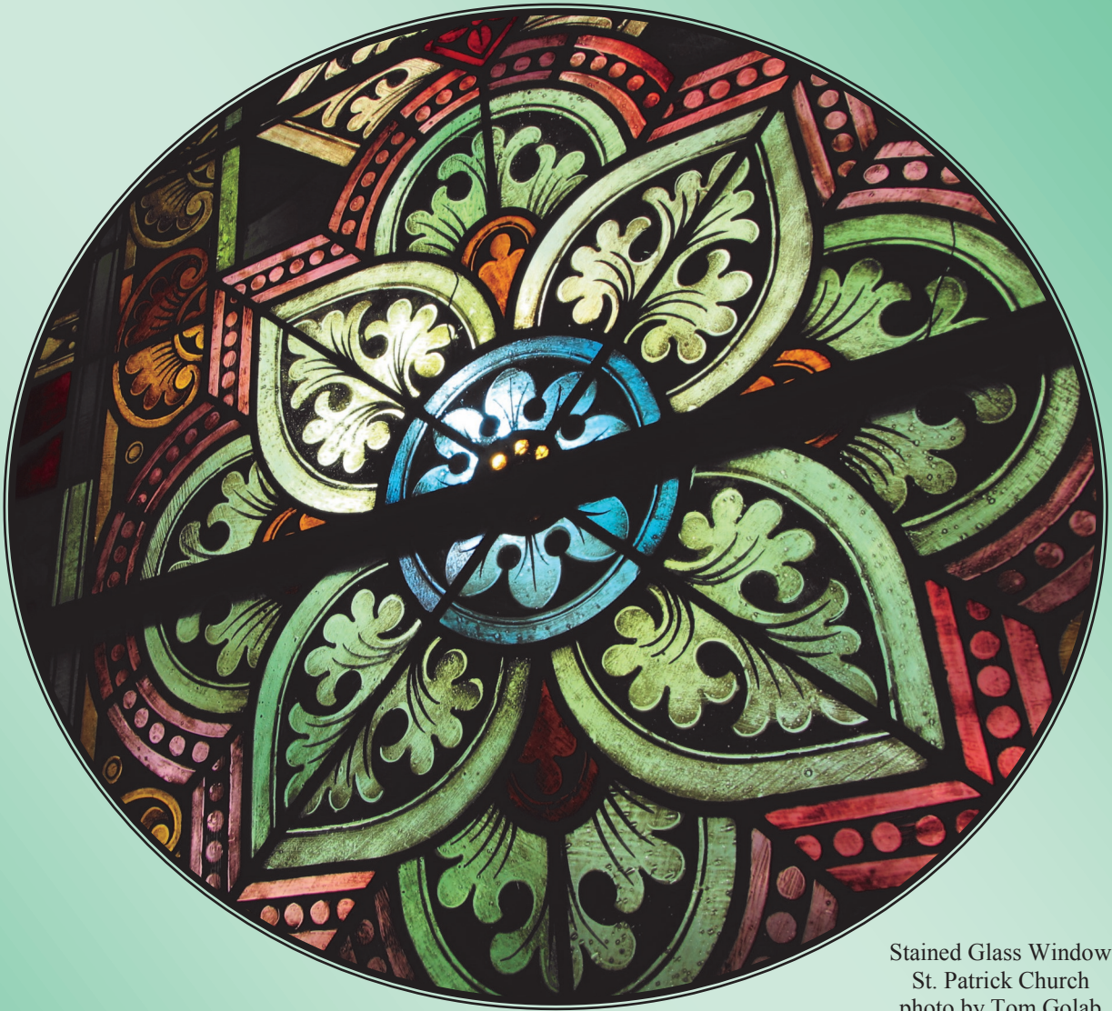
Stained Glass Window St. Patrick Church

Serving the East Bayfront of Erie since 1837