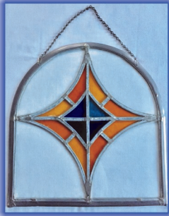
Arch 17" W x 17.5" H

This is YOUR OPPORTUNITY to OWN a PIECE of HISTORY by purchasing Raffle Rickets for Original CATHEDRAL Stained Glass