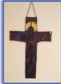
Constructed Cross 12" W x 17.25" H

Raffle Tickets can be purchased ON-Line at www.stpetercathedral.com , after weekend masses at the Cathedral, or by calling Mary Therese at 814-452-6603