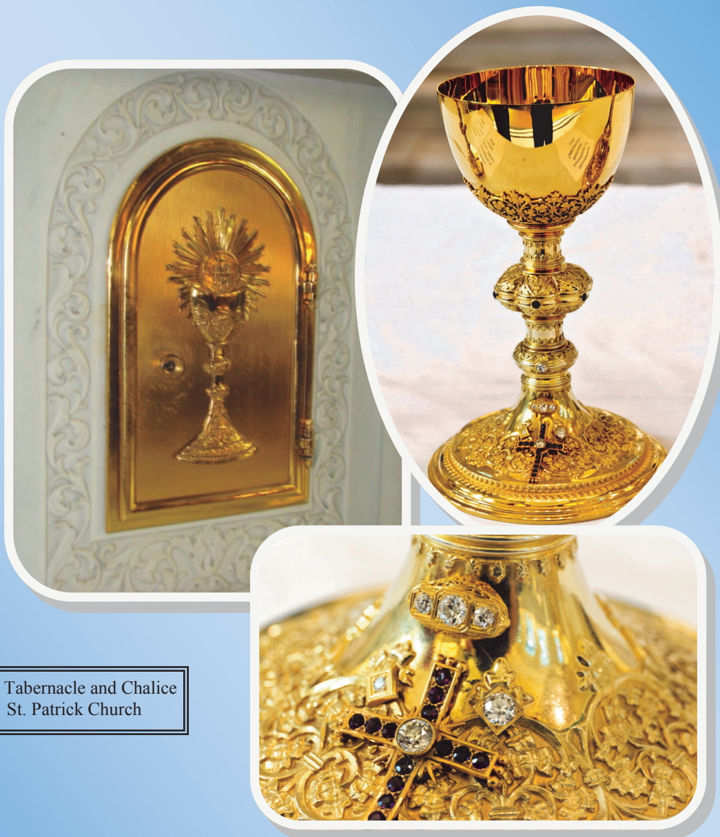
The Tabernacle and Chalice St. Patrick Church