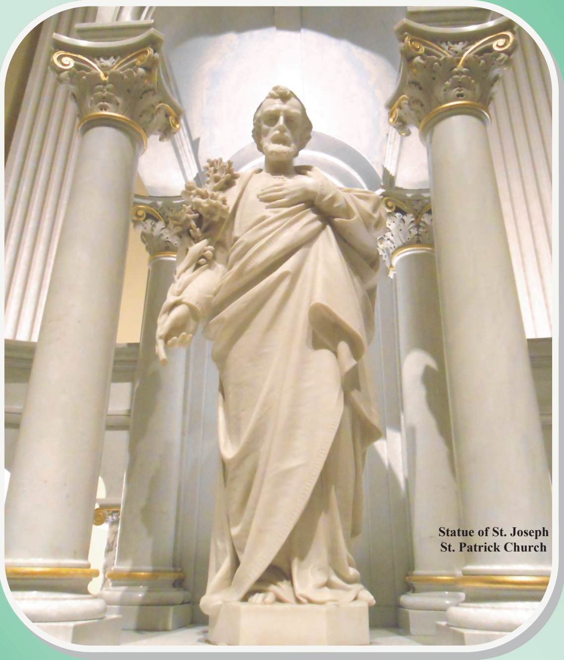
Statue of St. Joseph St. Patrick Church

Serving the East Bayfront of Erie since 1837