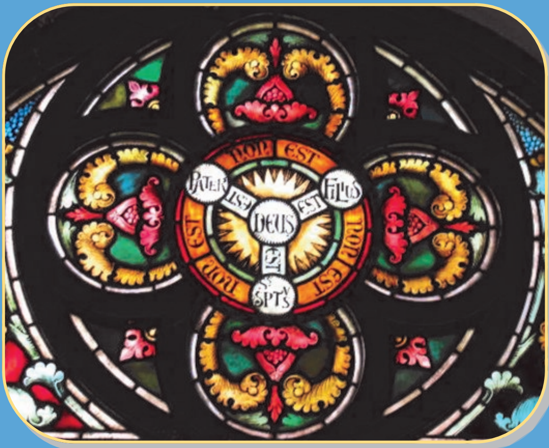
The Holy Trinity Stained Glass Window St. Patrick Church