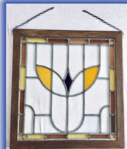
Abstract Floral 29" W x 30" H

Winners will be drawn at "Anchored by Faith and Family" Gala on June 30, 2018