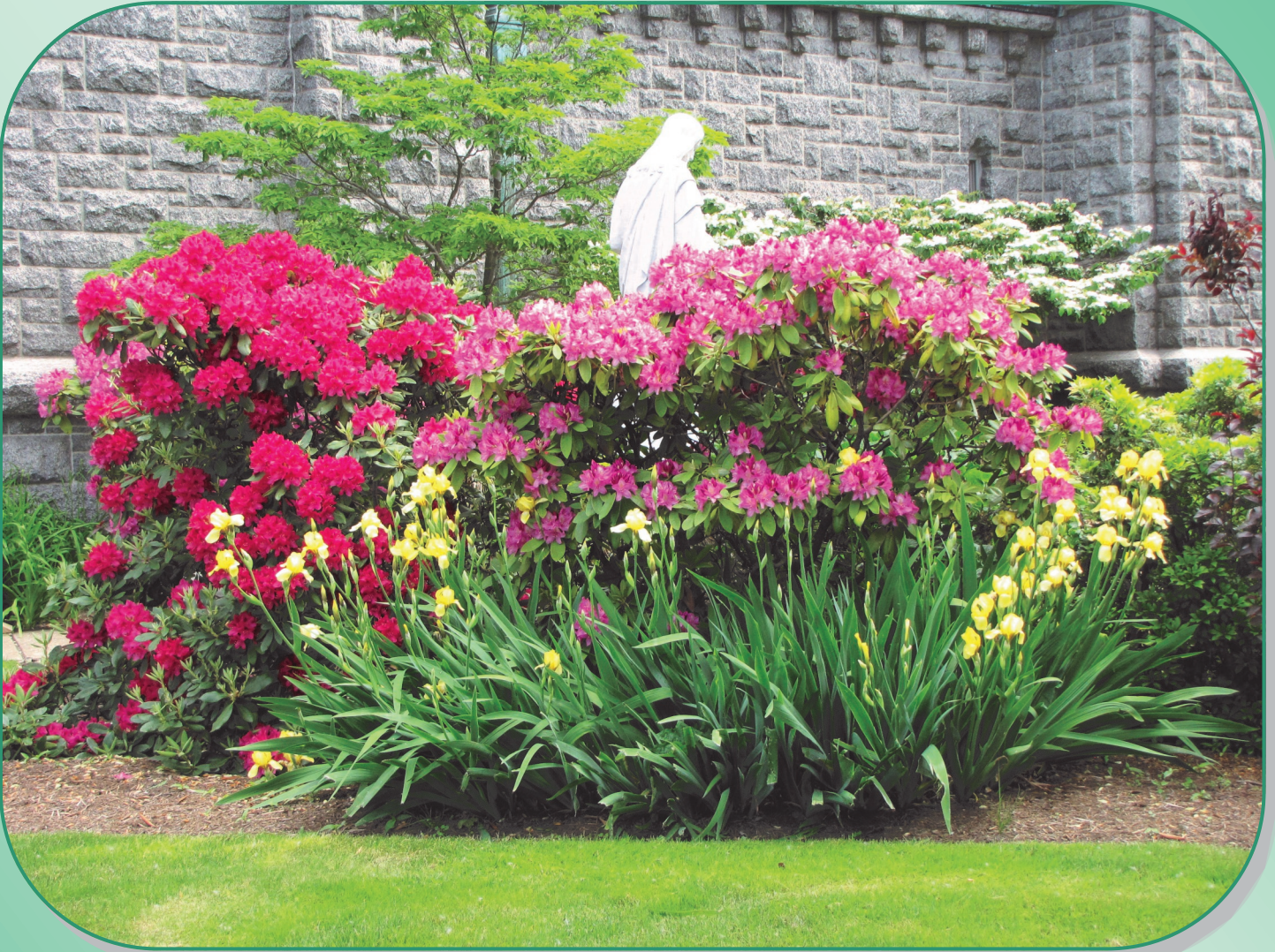
Shrine of the Sacred Heart Courtyard at St. Patrick Church