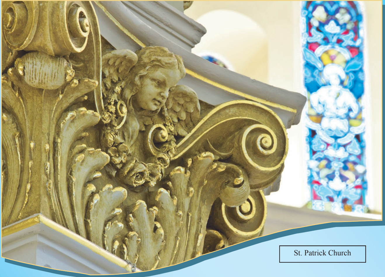
St. Patrick Church

Serving the East Bayfront of Erie since 1837