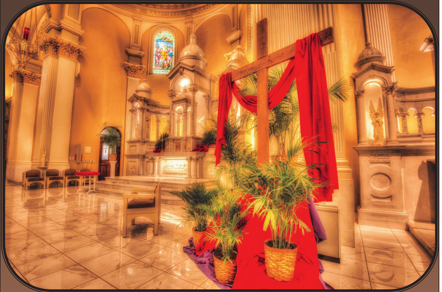
St. Patrick Church

Serving the East Bayfront of Erie since 1837