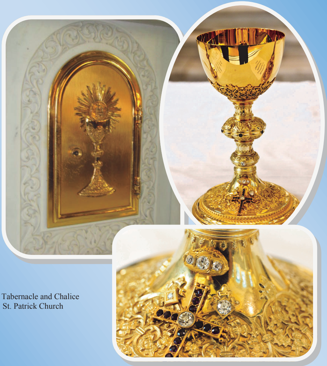
The Tabernacle and Chalice St. Patrick Church

Serving the East Bayfront of Erie since 1837