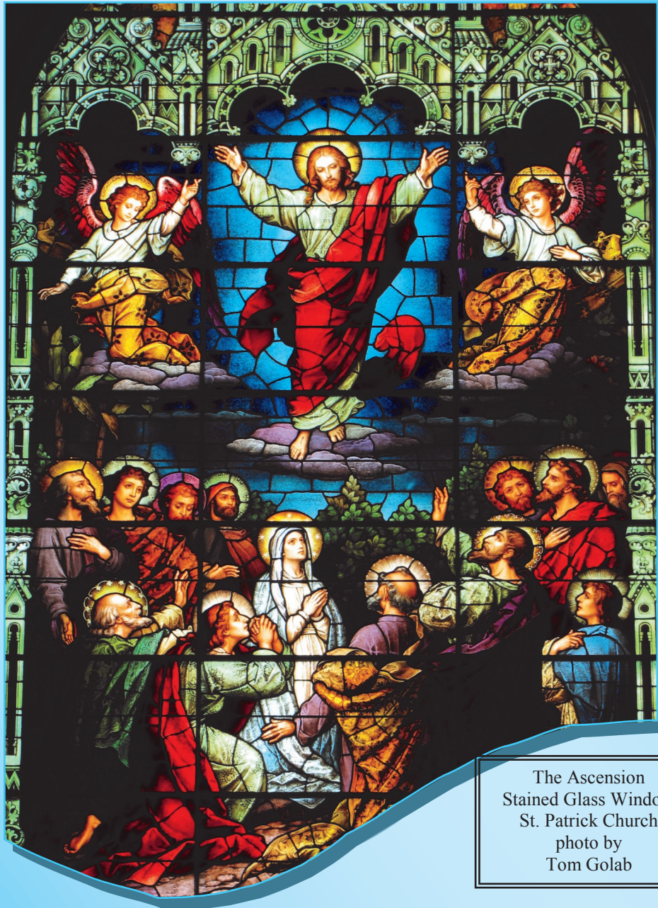
The Ascension Stained Glass Window St. Patrick Church

Serving the East Bayfront of Erie since 1837